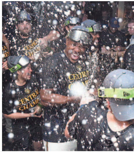
Despite a loss Tuesday, the Brewers celebrated clinching the NL Central.

But it's not in the champagne showers or the sneak-attack beer-dousings where you really see a team's connect- edness.